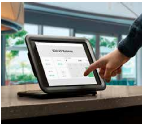
COUNTER-TOP POINT OF SALE