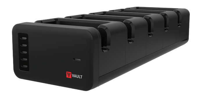
Integrated with JAMF Pro Customize workflows with JAMF MDM Solution